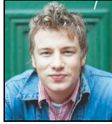
JAMIE OLIVER THE NAKED CHEF 2