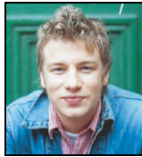
JAMIE OLIVER THE NAKED CHEF 2